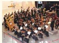
La Folle Journée au Japon

La Folle Journée au Japon http://www.lfj.jp/lfj_2013e/index.html?id=hedder Art Award Tokyo Marunouchi 2012 http://www.artawardtokyo.jp/2012/en/