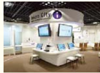
Tokyo City i

With Tokyo City i located in the JP Tower, the JR East Travel Service Center in the Tokyo Station Marunouchi Building, TIC Tokyo in Marunouchi Trust Tower North, and the JNTO Tourist Information Center in the Shin-Tokyo Building, the OMY area is more than ready to provide most information that overseas tourists need.