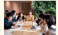
Morning University of Marunouchi class

The Uchimizu Water Sprinkling Project, a district-wide event in which thousands of area workers participate, is now in its 8th year. To encourage even more participation, Ecozzeria sponsors Uchimizu Weeks during which shops and offices along Marunouchi Naka-dori Street sprinkle water on the sidewalks in front of their establishments each day. The association has also begun to hold regularly scheduled 3*3 Labs. These workshops bring the young people who are expected to become the next-generation leaders in addressing social issues together with the most prominent designers and producers for discussions and lessons on social design.