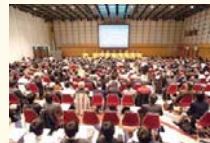
Urban Renovator's Forum in Tokyo

This helps expand and improve networking among the organizations, as well. In 2012, Urban Renovator's Forums were held in Nagoya, Osaka, and Tokyo with a total of 900 participants in the three cities.