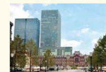
View of Tokyo Station from Gyoko-dori Avenue

With regard to urban tourism, the OMY Council conducted a survey of the effects of the 2012 Tokyo Annual