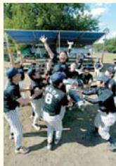
Marunouchi Baseball Tournament

Ligare hosts the annual Marunouchi Baseball Tournament, with some 60 teams vying for the trophy, and also conducts cultural seminars on a variety of subjects.