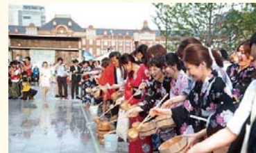
Uchimizu (Water Sprinkling) Project 2012

Taking full advantage of the area's function as an international business center, Ecozzeria pursues practical activities undertaken by this diverse community. The association works to educate and distribute information through events like the Uchimizu (Water Sprinkling) Project and Eco-kids Explorers program, as well as its Earth University and other seminars.